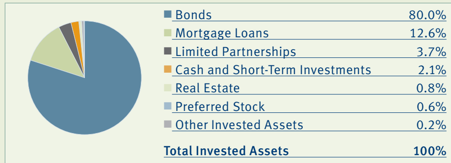
Mutual of Omaha and Insurance Subsidiaries Consolidated Invested Assets

Since our founding back in 1909, Mutual of Omaha has remained steadfast in our commitment to a disciplined investment strategy. This discipline has served us well in good times and bad. We design, build, monitor and manage a diversified portfolio of carefully selected investments that offer attractive returns, while still maintaining an appropriate level of risk. Here is a snapshot of our investment portfolio and an explanation of some of its key components.